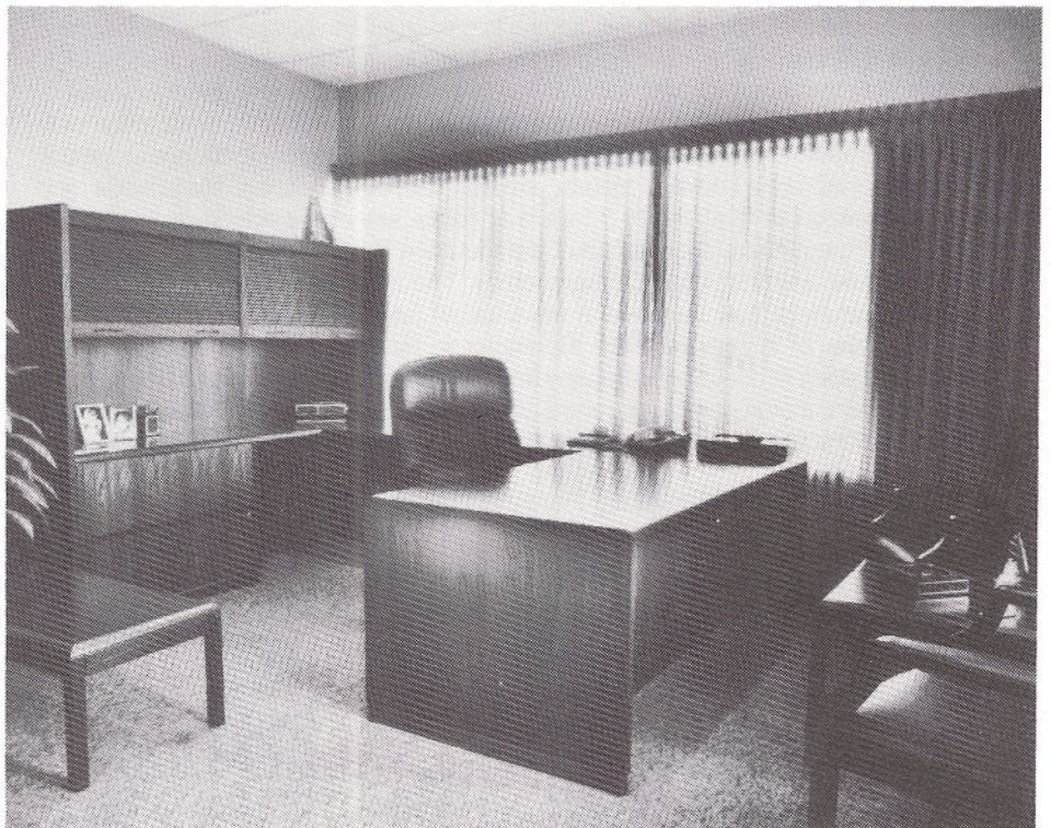
Prairie Woodcraft's pride is shown in their quality of workmanship.

All furniture is "made to order" and assembled on-site by Crown Office Interiors,